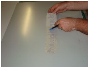
Step 7 (laying decal)