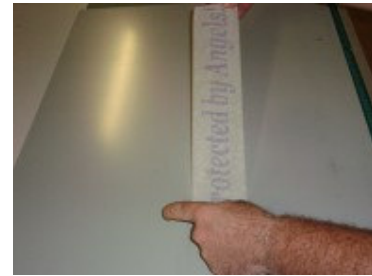
Step 7 (attach at one end/side)