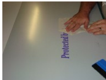
Step 9 (remove transfer tape)